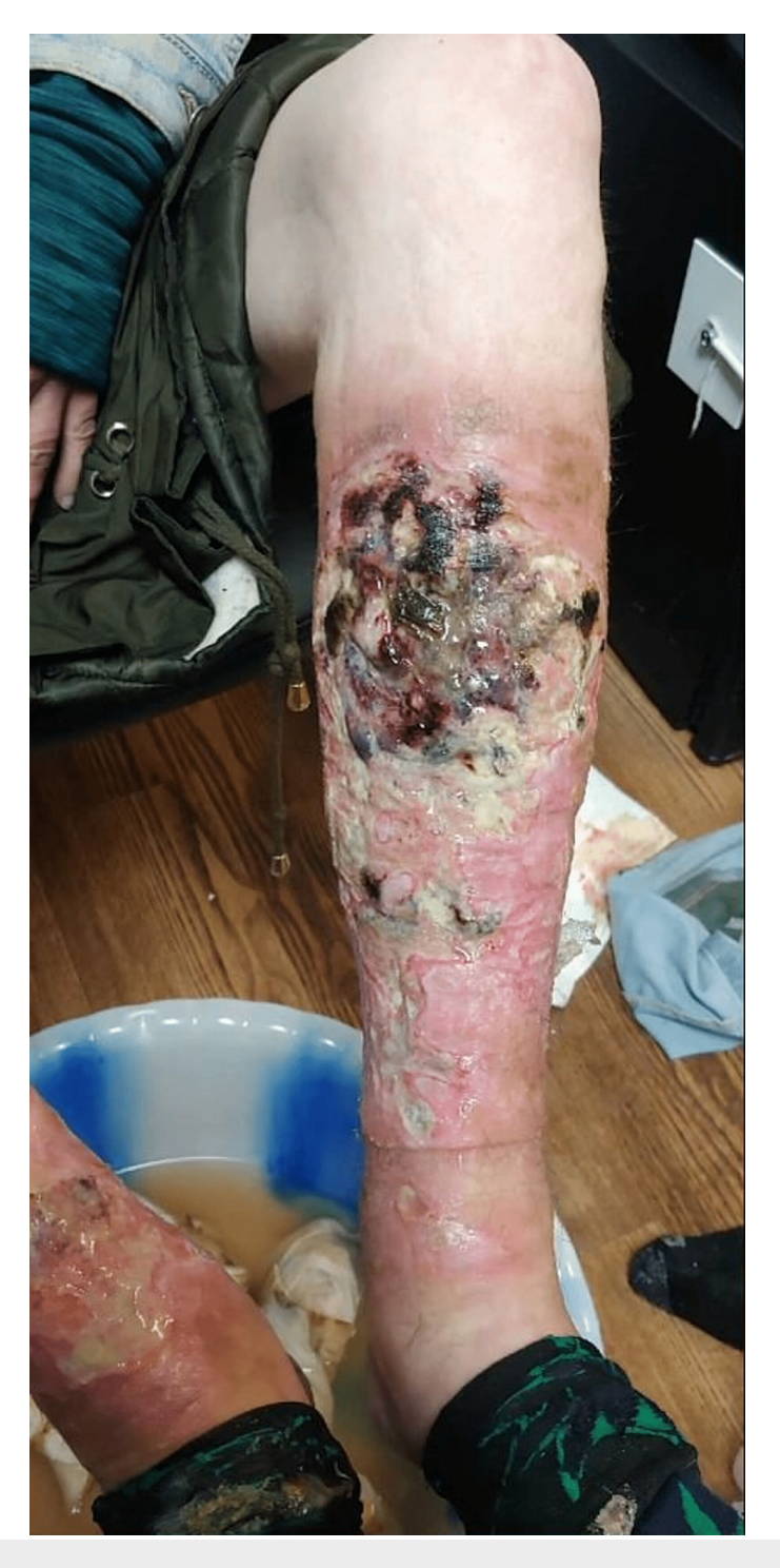
FIGURE 1: Xylazine-induced leg skin ulcers, cellulitis and osteomyelitis in a person who injects drugs in Philadelphia