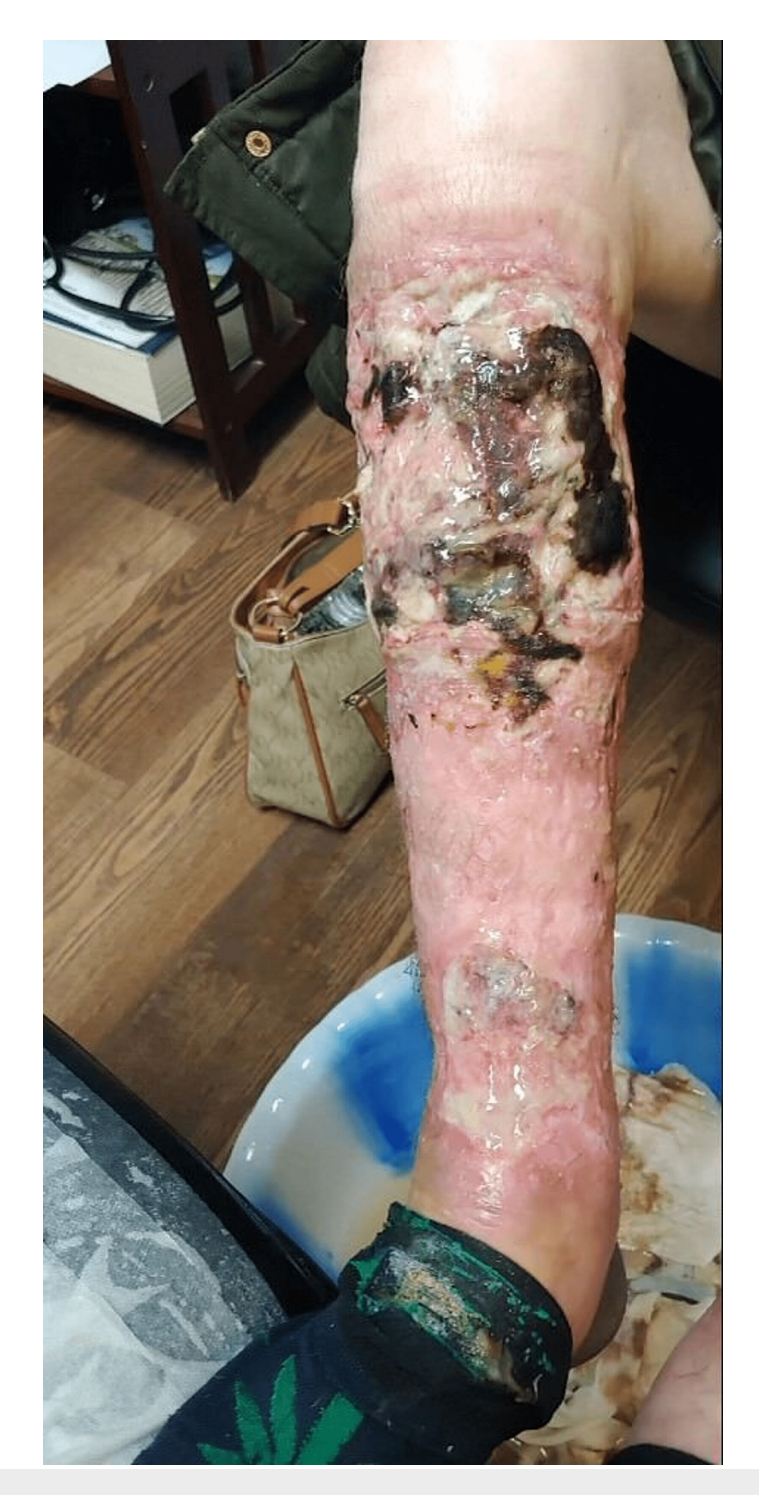
FIGURE 2: Xylazine-induced right leg cellulitis, wound infection and osteomyelitis in a person who injects drugs

She reported that the ulcers started spontaneously a few weeks ago and gradually got worse. She denied any injury or insect bites that might have led to the wounds. She usually injects into her hands, but sometimes into her legs as well. Whenever she missed a vein, she noticed that the areas were ulcerated. She reported that these wounds were progressively getting worse, unlike any of her prior wounds.